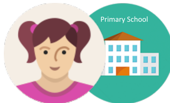
Year 6, female , high achiever, no behavioural concerns with a small circle of friends.

“I really need to speak to you because lately I've been thinking about life and how I just hate mine and how I just want to die”